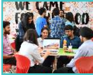
Multi cuisine cafeteria